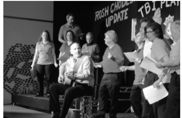
The TBI Players performed another one of a kind Purim Shpeil that kept the audience laughing even after the final bow.