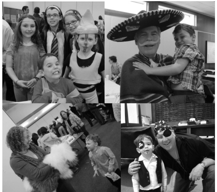
Purim was celebrated at TBI by children of all ages!