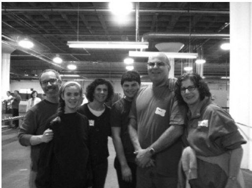
On March 11, a group of TBI'ers volunteered to help pack food at Maot Chitim. As always, their assistance was appreciated. (And it looks like they had fun, too!)